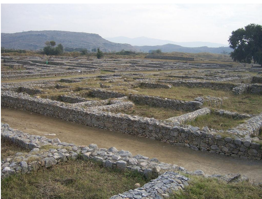
A beautiful view of Sirkap City Taxila

Many prominent personalities in the past have visited Taxila who plays an important role in the past. Few of them are mentioned in this research.