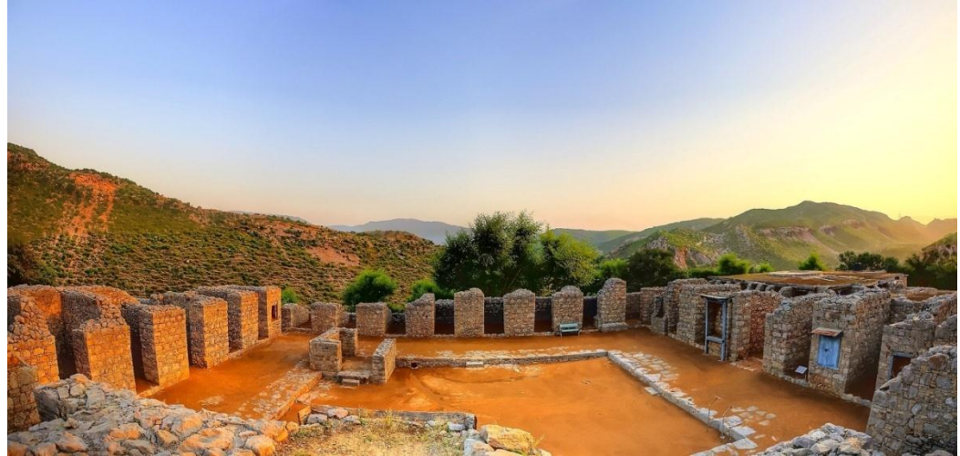
Julian Buddhist monastery in Taxila