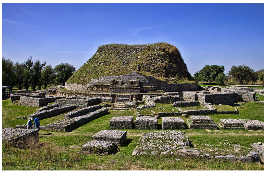
Dharmarajika stupa

ISSN Online: 2709-7625 ISSN Print: 2709-7617